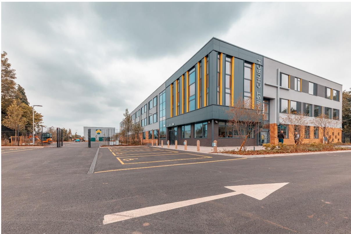
Christ Church, Church of England Secondary Academy

We are pleased to announce two new schools that have recently joined our BDMAT family of schools. On 1st July 2021 we were joined by Bentley Heath CofE Primary School in Solihull. Previously, the school had been a stand-alone academy, but the governors of the school decided that the future of the school was as part of a larger Christian MAT; and on 1st September we opened our new secondary school, Christ Church Secondary Academy in Yardley Wood, Birmingham. We now educate over 4,000 pupils in 19 schools across three local authority areas in the West Midlands, making us one of the largest MATs in the area.